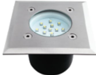
GORDO LED14 SMD-L