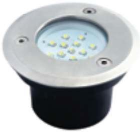
GORDO LED14 SMD-O